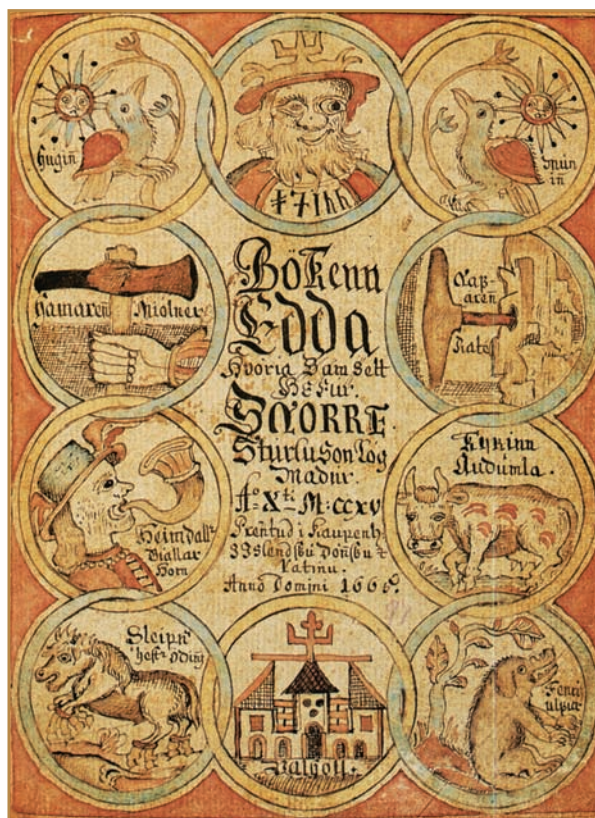
Title page of a manuscript of the Prose Edda , showing Odin, Heimdall, Sleipnir, and other mythological figures. From the 18th-century Icelandic manuscript IB 299 4to, in the care of the Icelandic National Library