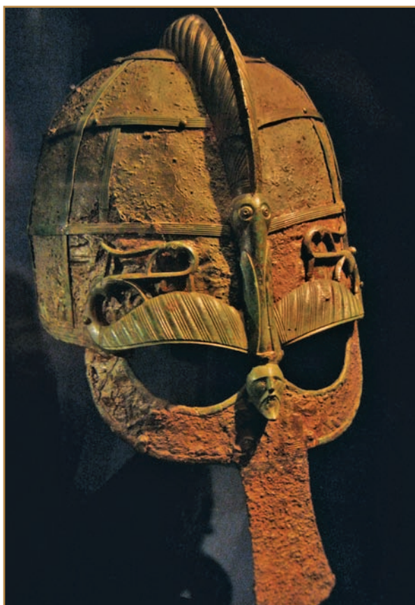
A Migration Period iron helmet excavated from a boat grave in Vendel, Uppland, Sweden

Those peoples most connected with the mythology now known as NORSE were well established on the Scandinavian peninsula and in DENMARK at the beginning of this period. They spread with other tribes, extending their reach to GREAT BRITAIN, the FAROE ISLANDS, ICELAND, and even Ireland. This migration was recorded by Roman writers such as the historian Tacitus and later by the Danish historian SAXO GRAMMATICUS.