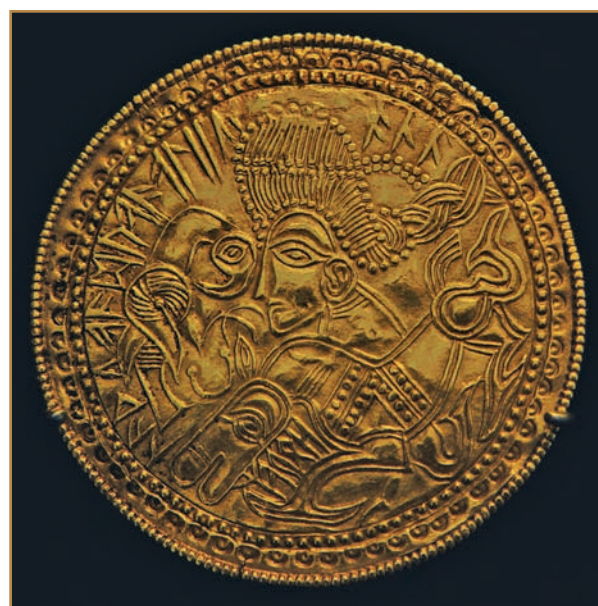
Bracteate from Funen, Denmark, featuring an inscription that includes the term “The High One,” a name for Odin

BREIDABLIK (Broad Splendor; Wide View) The shining hall of the god BALDER, located in ASGARD. Breidablik is the seventh of the gods’ homes described in the poem GRIMNISMAL . It is located in a land free from evil, where only fair things dwell, including