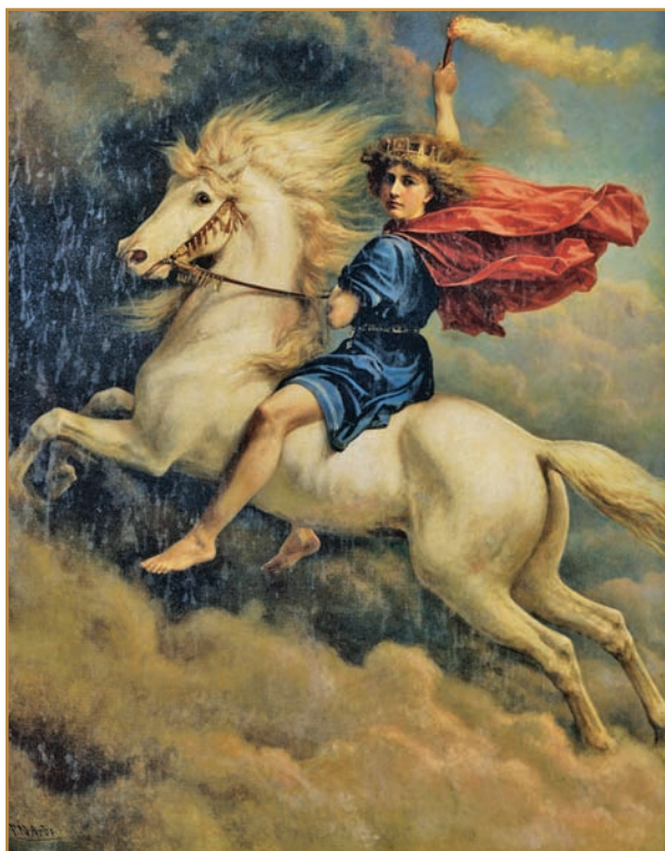
Peter Nicolai Arbo's painting of Dag riding Skinfaxi (1874)

DAIN (1) A DWARF mentioned only in HYNDLULJOTH , a part of the POETIC EDDA , as one of the creators of the gold-bristled boar HILDISVINI. According to this poem, Dain and his brother, NABBI, made the magical boar.