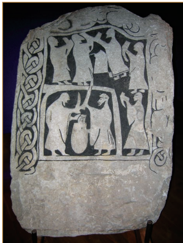
Depiction of warriors drinking mead on a runestone

MEGINGJARDIR (MEGINGJORD, MEGINGIORD, Power Belt) The name SNORRI STURLUSON gave to the god THOR's magic belt. When the thunder god fastens it on, his already great powers become twice as strong. Meginjardir was one of three of Thor's great treasures, which included his mighty hammer, MJOLLNIR, and iron gloves. The belt is