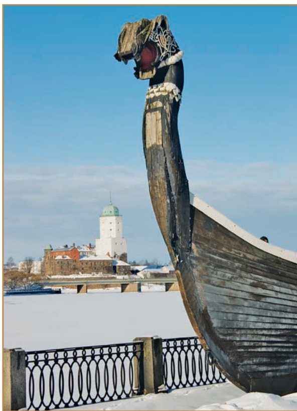
Detail of a Viking ship found in Vyborg, Russia

VILI According to SNORRI STURLUSON in GYLFA-GINNING , one of ODIN's brothers, along with VE; son of BOR and the GIANTESS BESTLA. Together the three sons of Bor created the Earth and the heavens from the body of the giant YMIR and the first HUMANS from