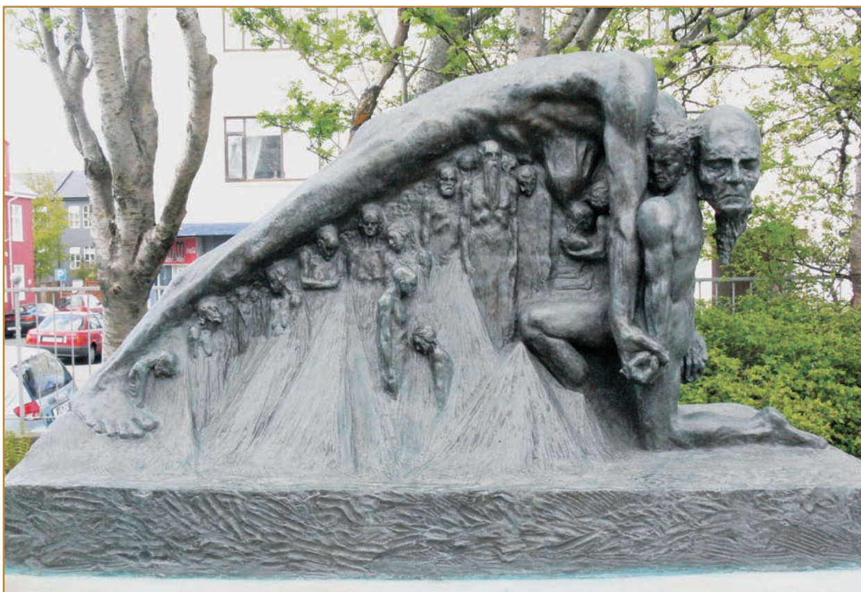
Thor Wrestling with Age. Sculpture by Einar Jónsson (1873–1954), Reykjavik, Iceland

Leipt, Slid, Syol, Sylg, Vid, and Ylg. The rivers froze and roared into GINNUNGAGAP, the abyss, as glaciers. The first giant, YMIR, was formed from the frozen poison of the Elivagar (see CREATION).