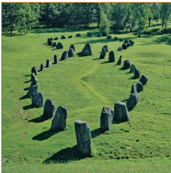
Burial mound in the shape of a sailing ship in Anundshög, Sweden

grew within King Volsung's hall. Only SIGMUND, son of Volsung, could draw the sword from the tree. After the sword was broken into shards in a battle between Odin and Sigmund, the dwarf REGIN put the pieces