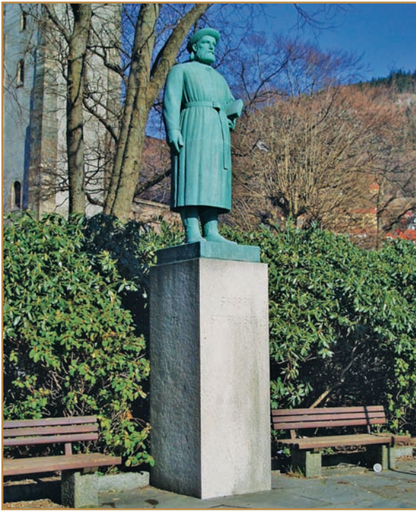
Statue of Snorri Sturluson by Gustav Vigeland, in Bergen, Norway

SOL (Sun) According to 13th-century Icelandic poet SNORRI STURLUSON, a servant of the SUN. Sol was the daughter of the human MUNDILFARI and the sister of MANI. The gods stole Sol and Mani from their father when they were children—or perhaps young adults, since Snorri says Sol was married to a man named GLEN. The gods were offended that a HUMAN, Mundilfari, had named his children after the Sun and the Moon.