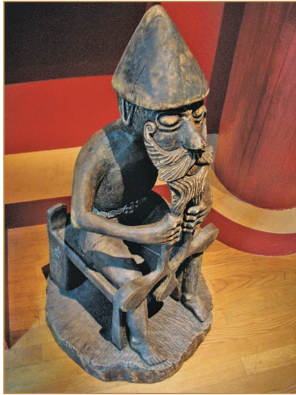
A wooden reproduction of an Icelandic statue of Thor at the Swedish Army Museum

Once safe in Asgard, Loki prattled on to anyone who would listen about the wonders of Geirrod's castle and how the giant was eager to meet the